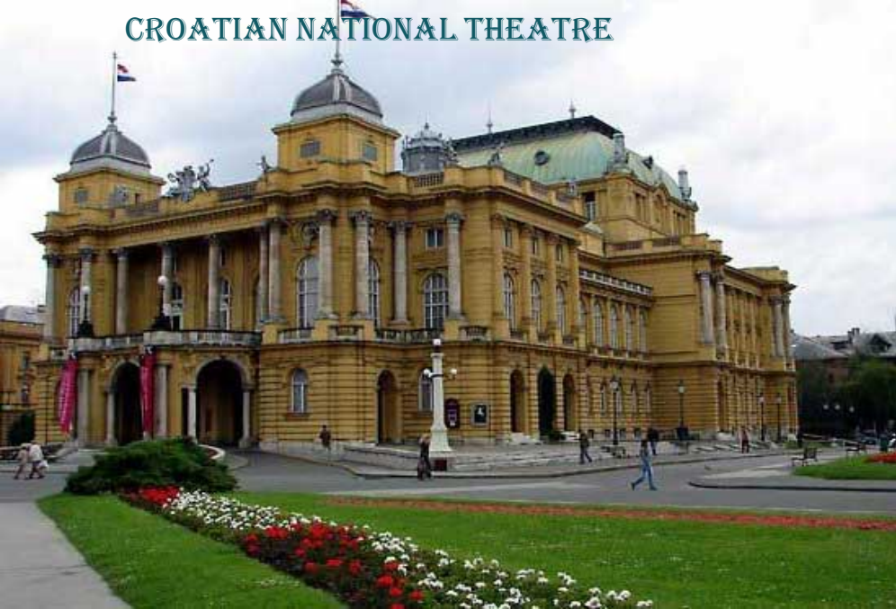
CROATIAN NATIONAL THEATRE

THESE ARE SOME OF THE MOST IMPORTANT INSTITUTION IN CROATIA